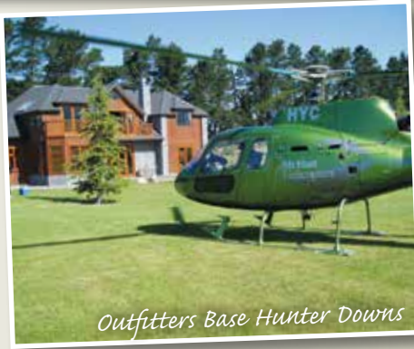
Outfitters Base Hunter Downs