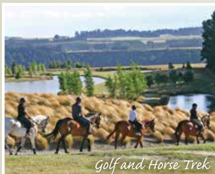
Golf and Horse Trek

These are some of the many activities and adventures you can enjoy while on your NZ Four Seasons Safari.