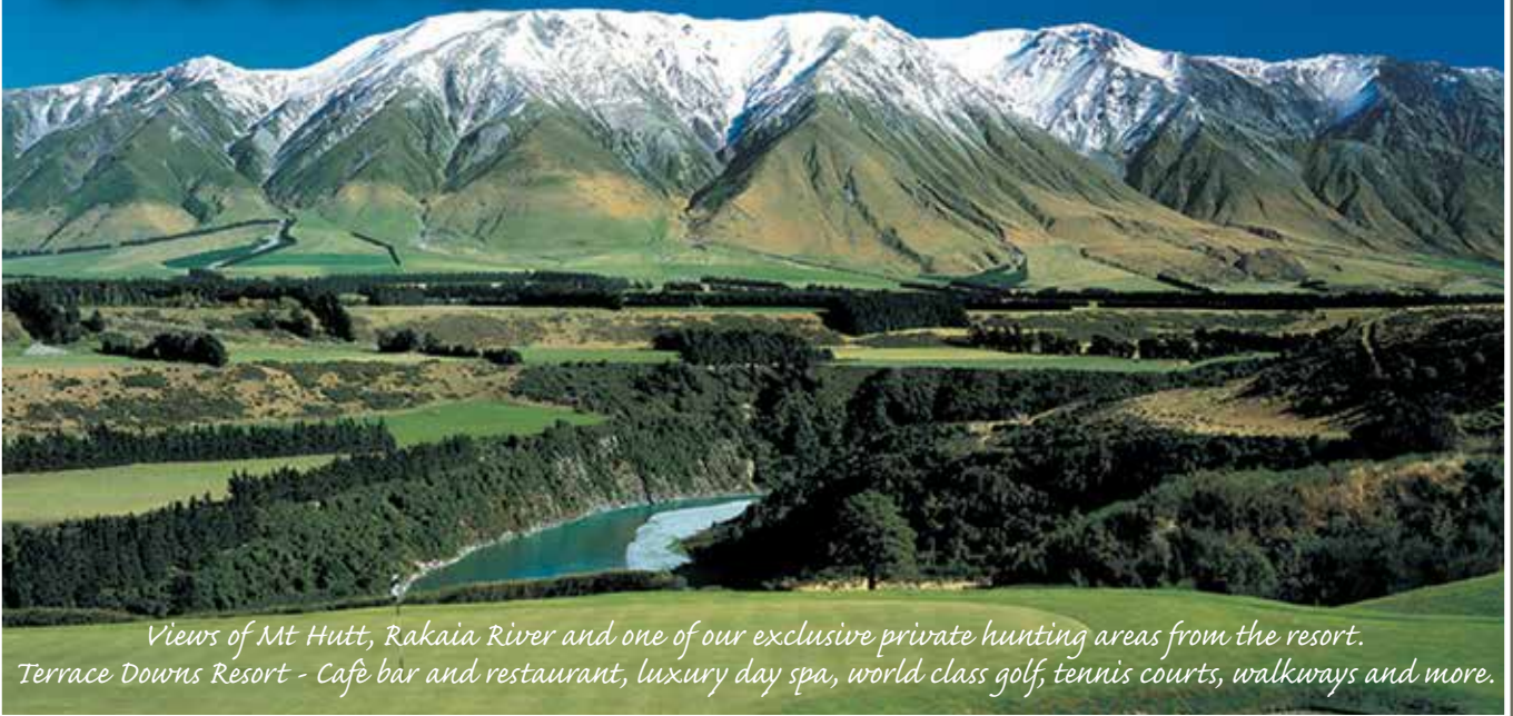
Views of Mt Hutt, Rakaia River and one of our exclusive private hunting areas from the resort. Terrace Downs Resort - Cafe bar and restaurant, luxury day spa, world class golf, tennis courts, walkways and more.